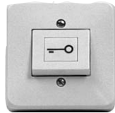
909S/909F 2-3/8" x 2-3/8" (60.3 x 60.3mm)