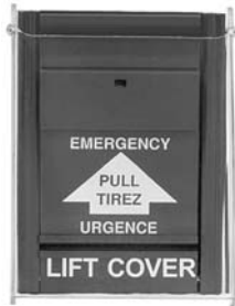
904 3-1/2" x 4-3/4" (88.9 x 120.6mm)