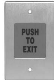
917 4-1/2" x 2-3/4" (114.3 x 69.9mm)